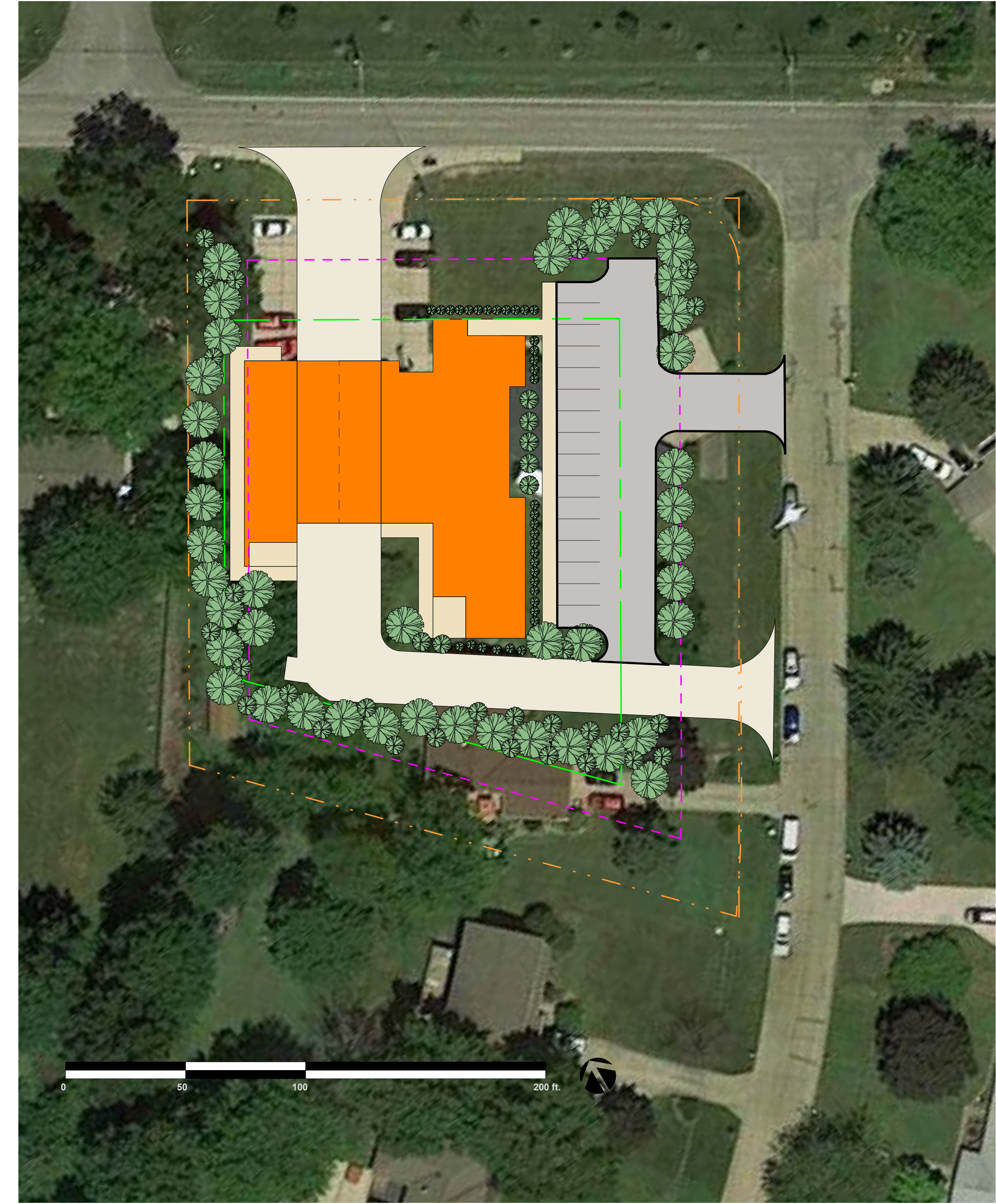
1 A9.03 STATION 2 - REVISED SITE PLAN 1" = 30'-0"