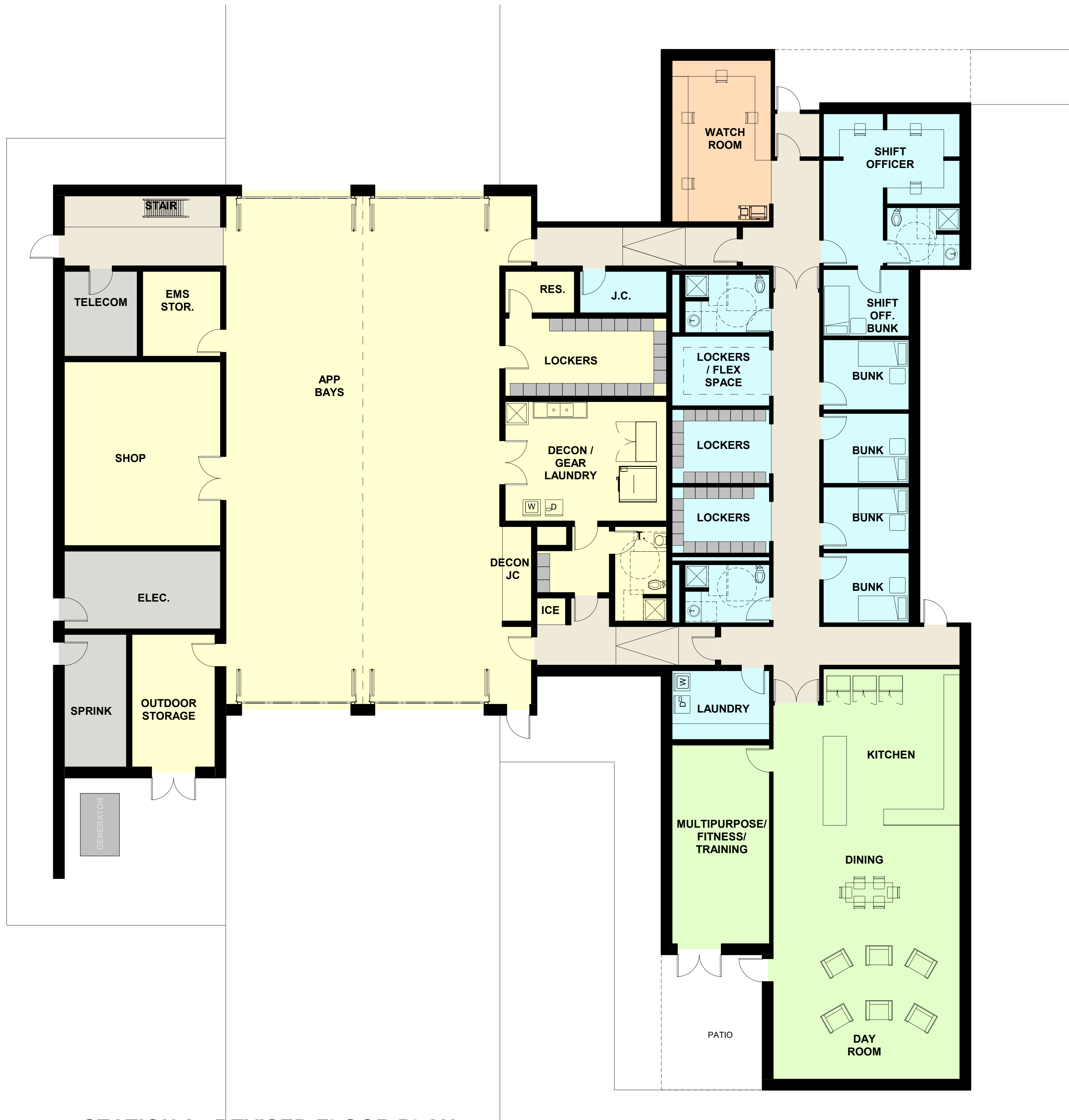
2 A9.03 STATION 2 - REVISED FLOOR PLAN 1/8" = 1'-0"